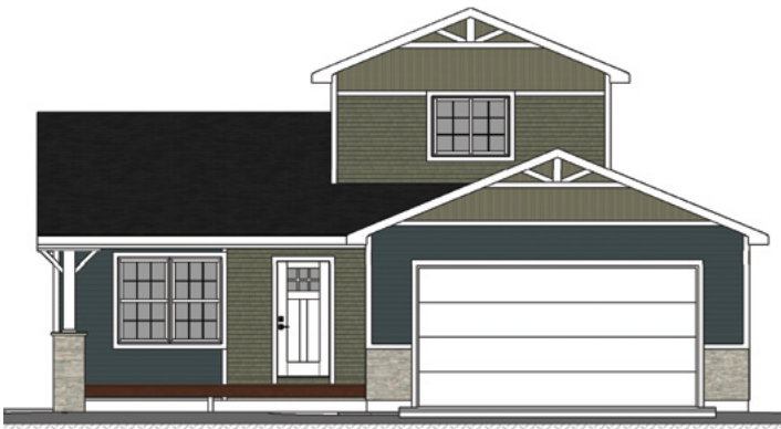
Orchard Suite Ultra