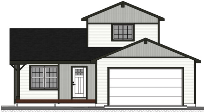
Orchard Suite Standard

With three color schemes, and Standard, Premium, and Ultra trim levels, Lakewood Trails allows you to choose your favorite custom options, suiting both your taste and your budget.