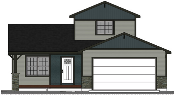
Orchard Suite Premium